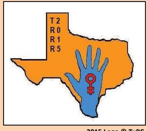
2015 Logo © TxPC