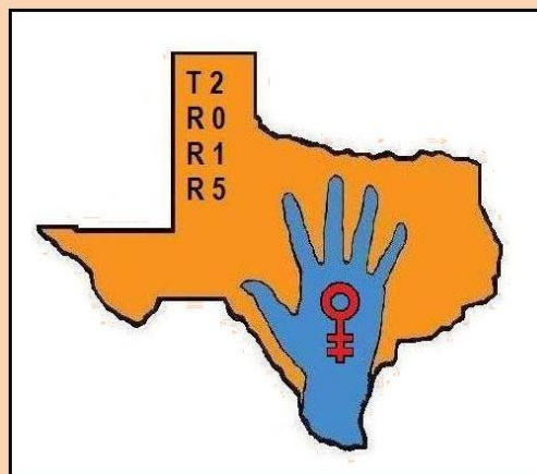
2015 Logo © TxPC